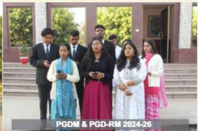
PGDM & PGD-RM 2024-26