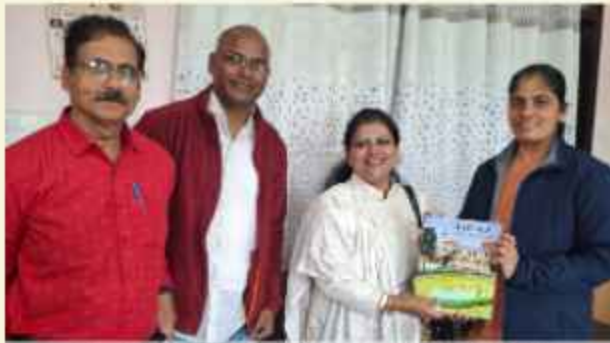
St. Joseph's Covent S.S. School, TFRI