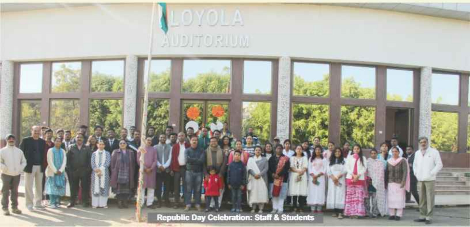
Republic Day Celebration: Staff & Students