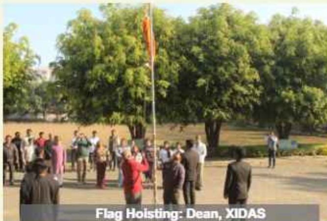
Flag Hoisting: Dean, XIDAS

Celebrating our Roots: Republic Day 2025