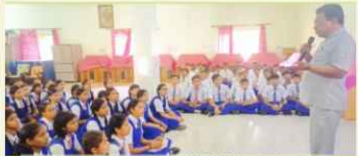
St. Joseph's Covent H. S. School, Ranjhi