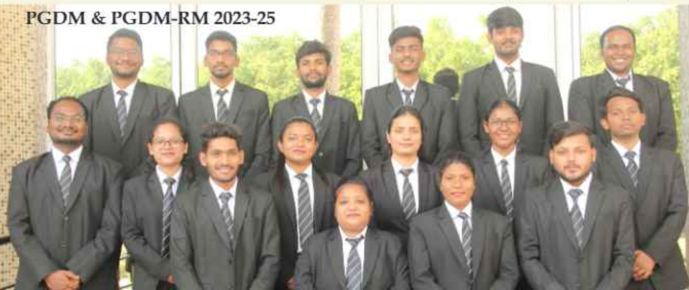
PGDM & PGDM-RM 2023-25