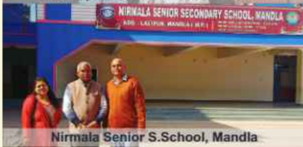
Nirmala Senior S.School, Mandla