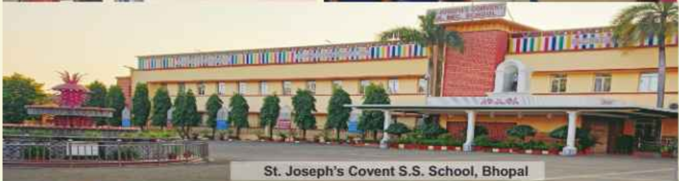
St. Joseph's Covent S.S. School, Bhopal